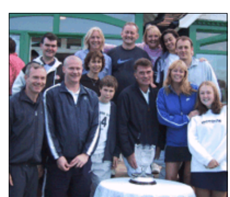
Norbury Park's victorious team with the coveted Millennium Cup Trophy they snatched from Wigmore 5-4 in 2002.