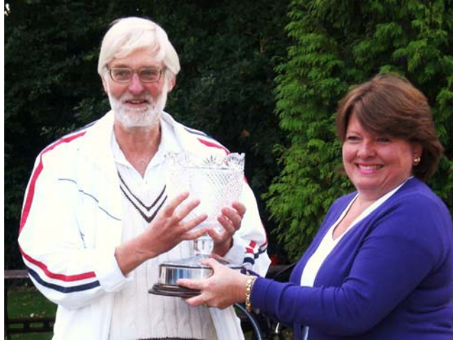
Grafton retained the Millennium Cup trophy in 2010.